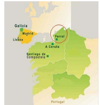
Galicia and the area of the Ferrol Plan

Also, the Spanish Ministry for Industry and the Galician Institute for Economic Promotion channel a series of attractive incentives through special programmes such as the Ferrol Plan, giving investors in industrial